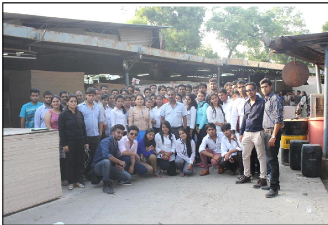
Students at Woodcraft's Pvt. Ltd., Nainital.

Every student has to prepare a report on the Industrial visit. The reports are evaluated and the best report get certificate of appreciation as well as the student has to give presentation in front of whole class.