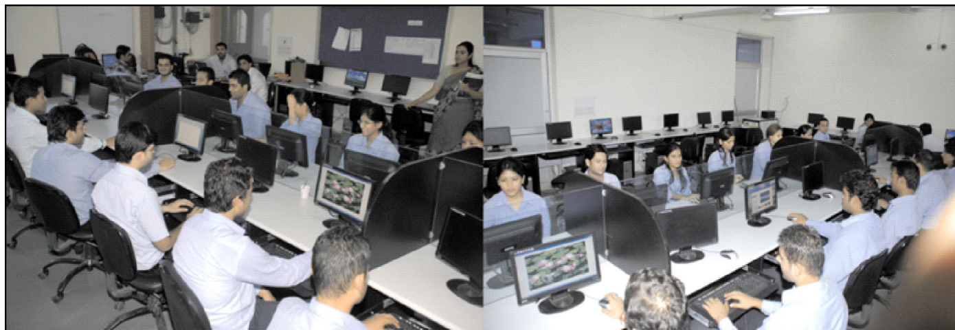
IT Lab, DSPSR.

Our Goal is to provide a conducive learning environment