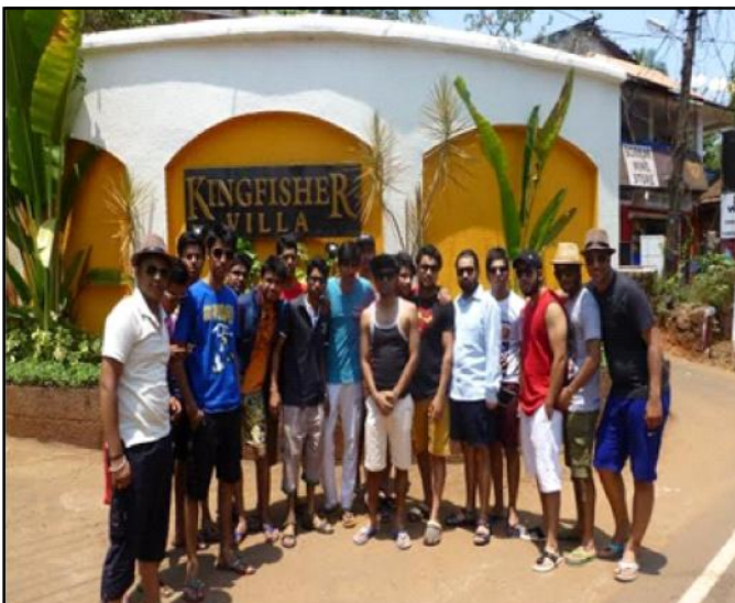
Students of DSPSR at the Kingfisher Facility in Goa

The students were acquainted with the manufacturing process of the company and as to how the company manages its