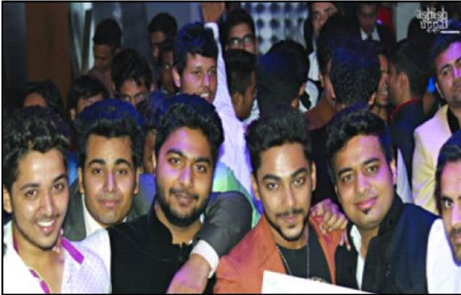
BBA (G) 2012-2015 Batch Students

The 2015 Farewell party for the final semester students was organized with huge fanfare and excitement on 11 th May 2015 at the Agni Club, The Park, (15, Parliament Street, Connaught Place, New Delhi) from 1:00 P.M. to 6:00 P.M.