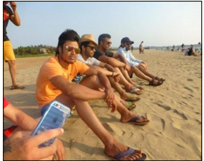
DSPSR Students enjoying the beaches of Goa

production targets both at the National and the International levels. The various departments of the plant were shown to the students and their queries on different aspects were discussed in a small seminar session organized by the