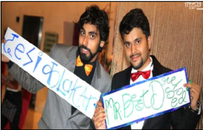
Fun activities during the Farewell event

Students of the outgoing PGDM 2013-2015 Batch and BBA (G) 2012-2015 Batch were felicitated by the students and faculty members of the institution.