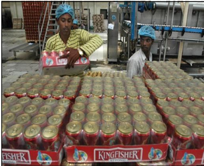
Storage of finished products