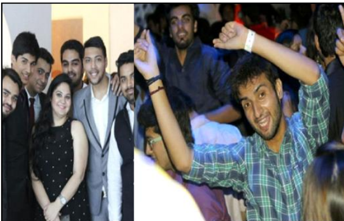
BBA (G) 2012-2015 Batch Students Students participated wholeheartedly in the Dance Tracks played during the Party