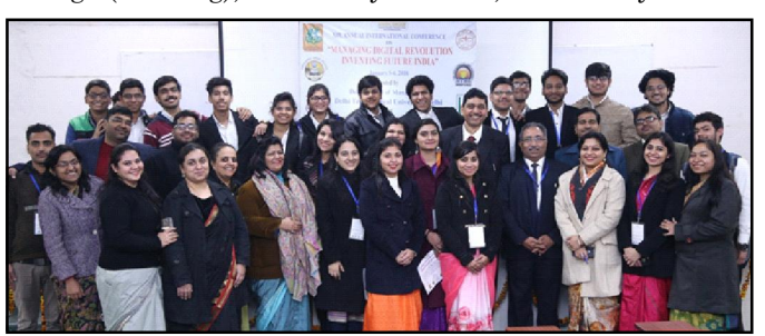
Delhi Maurya. The conference was sponsored by Indian Council of Social Science Research (ICSSR) and Oriental Bank of Commerce.

Management, Delhi Technological University (Govt. of NCT of Delhi); and, under the joint auspicious of Sri Aurobindo College (Evening), University of Delhi; and Rotary Club of