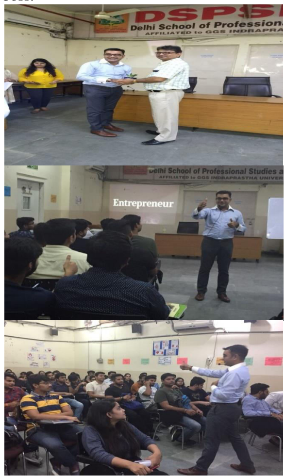
Some Snapshots of Seminar on Entrepreneurship

The seminar was extensively interactive and students learned a lot about what is going on in today's business world and how one can en-cash the opportunities to be one's own boss.