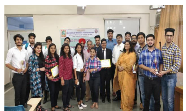
Some Snapshots of Business Competition Meet-2018 Induction of New Batch (2018-21):

After a brief hiatus of three months, CED started its regular programme for the new Academic Session with induction of CED members from the fresh batch of BBA and B.Com (Hons.).The Session commenced with a warm welcome to the new batch (2018-21) students of BBA and B.Com (Hons.).